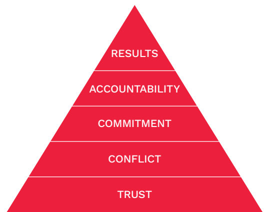
The Five Behaviors Model

The experience is completed through a half-day training session, led by a trained Five Behaviors expert. This session includes a walkthrough of the Personal Development profile, breakout activities, and group discussion.